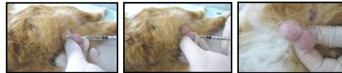
Fig. 4-5-6. Injection of calcium chlorid solution into the right and left testis of the male cat