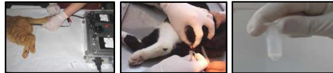
Fig. 1-2-3. Semen collection with electro-ejaculator (P-T Electronics) before injection of CaCl 2

Four male cats of mixed breed age from one to three years old and weighing between 3.5 and 4.0 kg were selected in this study. Three male cats (C1, C2 and C3) were injected with calcium chloride (10, 20, 40 mg concentrations) 0.2 ml/per testis. The control male cat (C4) received a single bilateral intratesticular injection of 0.2 ml sterile saline (0.2 ml/per testis). All animals were examined for testicular size, and, testosterone level and spermogram were performed before chemical injection, on Day 0 and then every 20 days for 2 months. General attitude, appetite, ability to walk, scrotal pain, rectal temperature, and scrotal evaluation beyond swelling were assessed on days 1-7 post-injection. Semen was evaluated for volume, sperm motility (%) and sperm morphology. Castration was then performed using a routine surgical procedure at 60 days after intratesticular calcium chloride injection. Testes from each animal were used for histomorphological studies.